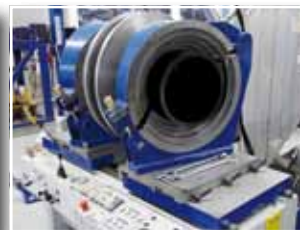
Butt Welding Machine