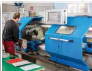
Turning Machine (automatic loading)