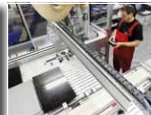
Flat-Bed Milling Machine